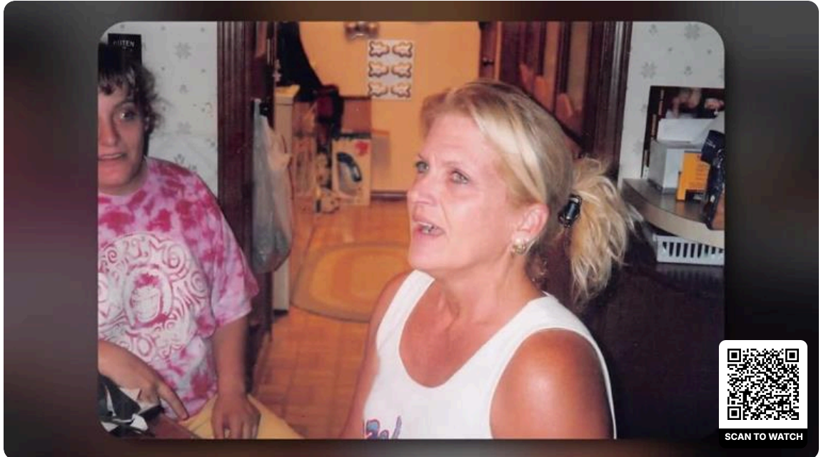
Lynne Moore Tribute Video